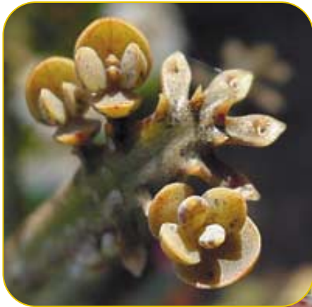
Fingers Kalanchoe tubiflora

This species has already escaped into the KNP along the village fence that fronts onto the Sabie River. It is found in camps like Lower Sabie and Pretoriuskop. Succulent species are a real threat to the natural vegetation as they are adapted to the harsh Bushveld winters allowing them to survive until the next rainy season. This species, along with other members of this family, is able to propagate via cuttings and leaf pieces.