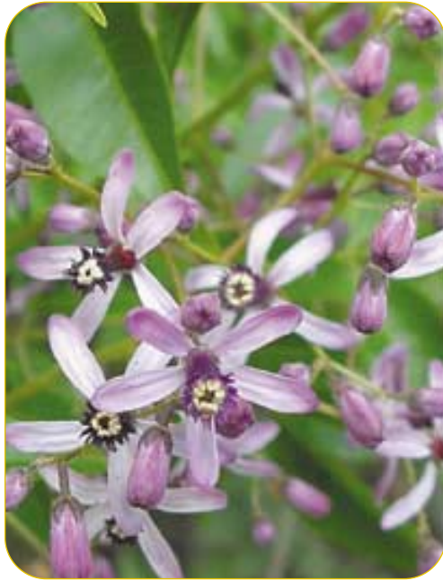
Syringa Melia azedarach

Another riverine threat spread by birds and mammals.