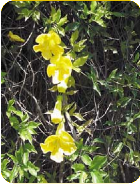
Cat's claw creeper Macfedyena unguiscati

This is a creeping member of this family, already escaping in the staff village.