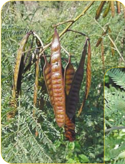
Leucana or Ipil-Ipil tree Leucana leucocephala

This is a creeping member of this family, already escaping in the staff village.