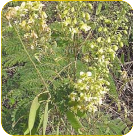
Mauritius thorn Caesalpinia decapetala