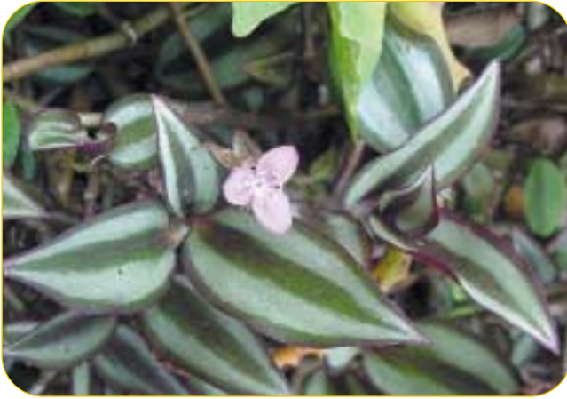
Wandering Jew Tradescantia zebrina

This species is now in the streams around the Staff Village. Plants are thrown over the fences into the KNP.