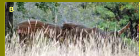
Elephant bull sleeping in RP - first on the left side (A) for 48 min and after an eight minute break lying down again on the right side (B) for 51min