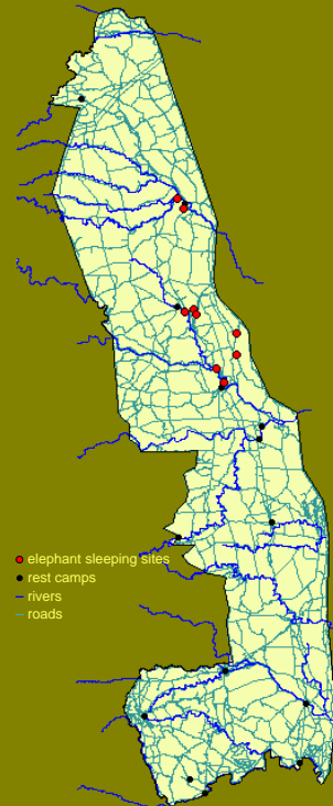
Figure 1: Locations in KNP where elephants were observed sleeping in lateral recumbency between Jun and Dec 2007

Although elephants can sleep standing, most of the studies indicate that elephants sleep in a recumbent position (RP) if undisturbed, and have an individual preference for lying on the right or left side. Observations revealed that elephants, if they lay down to sleep during the night, will often get up to feed and then lay back down to sleep again. The breathing rate so far observed in adult elephants sleeping in RP was 4.4 and 3.8 breaths/min, respectively. Similar sleep patterns have been described for adult African and Asian elephants in captivity, with a total sleeping time of 3.1-6.9 hours (1-4.5 hours in lateral recumbency) between the hours of 23:00 and 07:00. Further studies indicate that elephants in their natural habitat spend less time sleeping in RP (0.67-2 hours) compared to elephants in captivity, although the limitations of data collection under natural conditions could have contributed to the differences found.