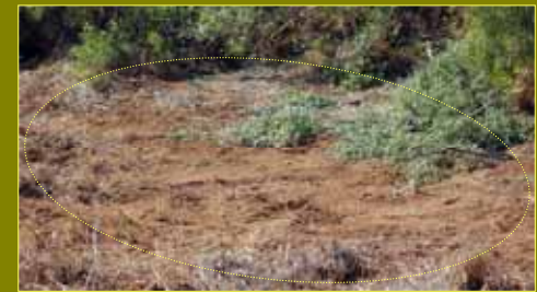
Typical sleeping place of an elephant on even ground - similar places were regularly found during field work