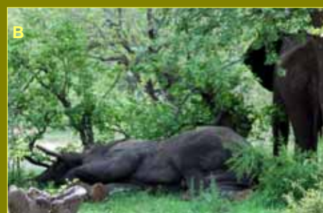
Elephants sleeping in RP were observed in dense and fairly open vegetation, far away from (>1000 m) and close to (< 50 m) roads, as well as sleeping without (A) and with elephants in immediate vicinity (B), respectively