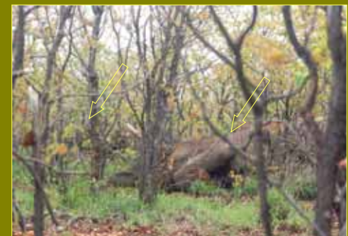
A group of elephant bulls (n=3, two visible in the photo) was observed sleeping in RP simultaneously for about 40 min in Mopane thicket on a rainy day - the distance between the individuals was approximately 8-10 m